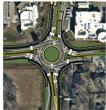
111th Street and Central Park Drive roundabout

The 111th Street intersections at Westfield Blvd. and College Avenue may be closed to the public during construction